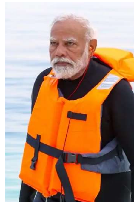
India first after taking office.

From a high under Ibrahim Solih, relations between the Maldives and India have been on shaky grounds since President Mohamed Muizzu came to power. He had run his campaign on an anti-India platform his 'India out' campaign garnered significant attention